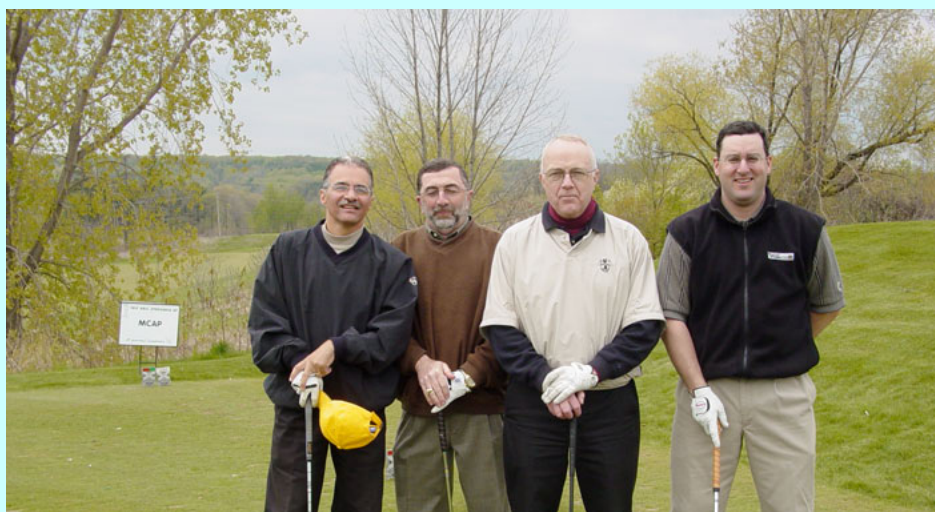
Picture taken at Silverlakes in 2006